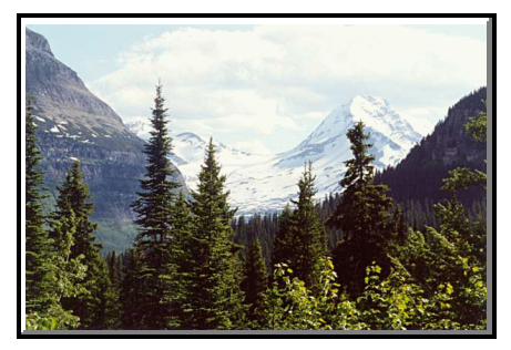
Mountains surrounding beautiful Glacier National Park