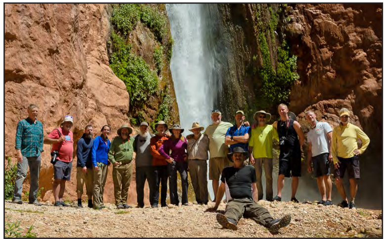
Our River Trip Crew at Deer Creek Falls

In all, everyone carried their own weight and were available to carry that of others if needed. It was a great mix of people to share our 2024 river trip with and we encourage you to visit our web site for the full wonderful story and links to some incredible trip videos expertly put together by our nephew Lee Potts.