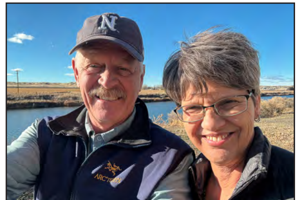
Our Love to All of you

We'd love to have you visit in person, but you can always visit us at our home page at www.pottsadventures.com .