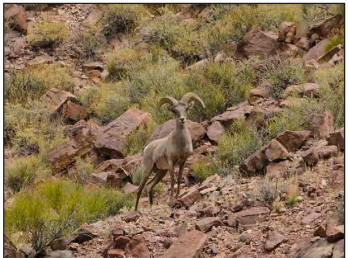
Desert Bighorn in the Grand Canyon