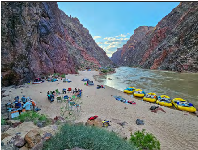
Grapevine Camp on the Colorado River