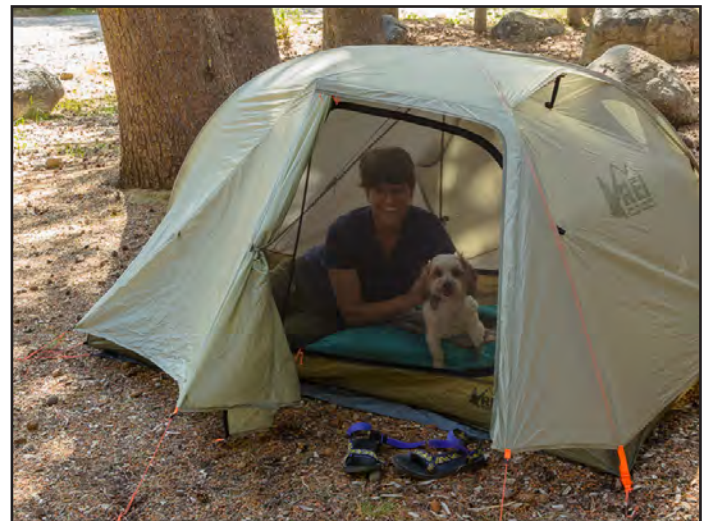
Here's Hoping your New Year is In-Tents-Ly Fun!