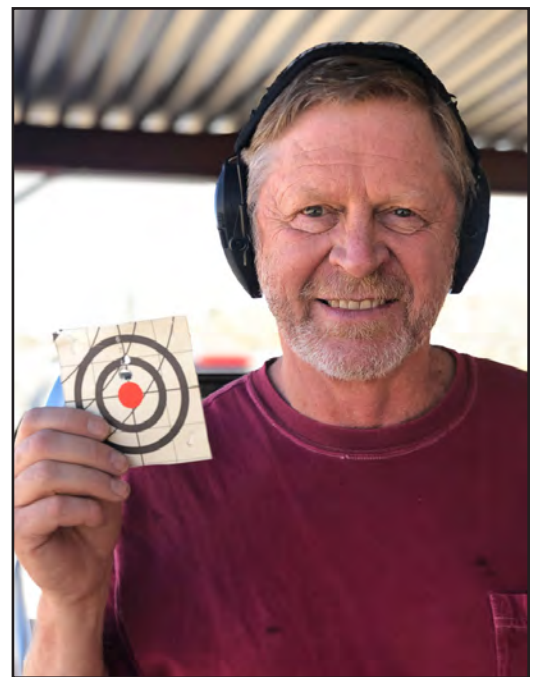
Four in One and a Flyer