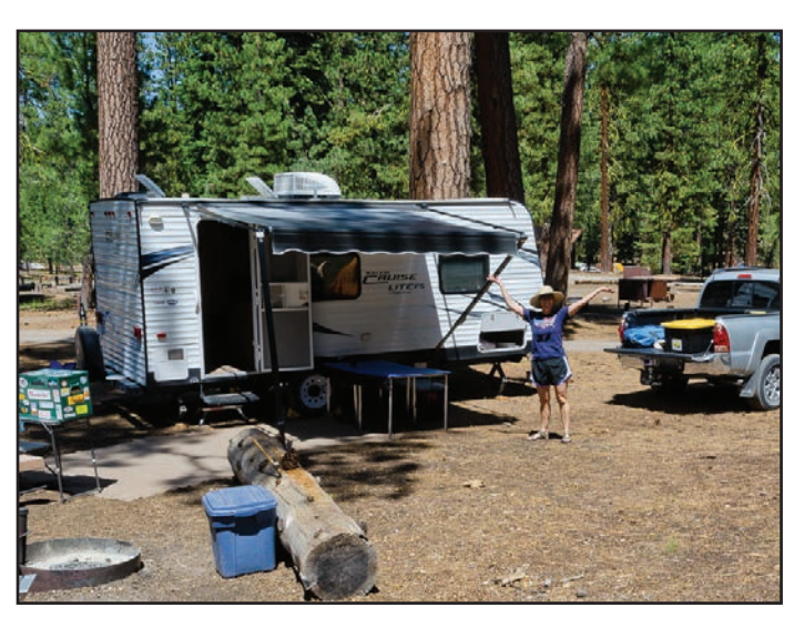
Our New Camper at Lassen National Park

enjoy knitting, hand sewing, trying new recipes and having a good laugh. These have been good mental breaks for me.