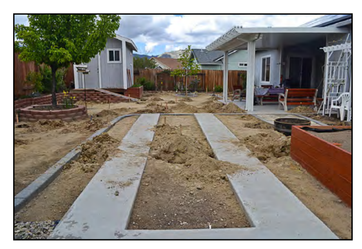
Our Backyard Renovation in Process

system, laying sod, pouring concrete, and building patio furniture. We also added a cover to the patio and had solar panels installed.