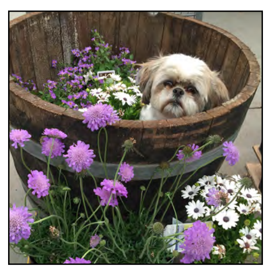
Christy Lelping Pick Out Flowers

system, laying sod, pouring concrete, and building patio furniture. We also added a cover to the patio and had solar panels installed.