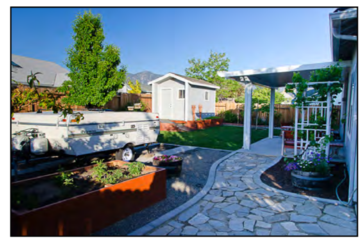
Our Finished Backyard

now a beautiful and functional place to live after many hours of sweat equity. When we bought our house a year and a half ago it was in good condition, but lacked those extra touches that make a house a home. The backyard was mostly a dirt lot full of weeds with a number of unfinished projects. Bob led the team effort of laying a stone patio, building garden boxes, putting in a sprinkler