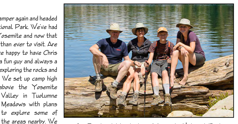
Our Family at May Lake in Yosemite National Park

called "Jurassic National Park." All this, plus numerous bike rides, playing in the pools of the Tuolumne River, and roasting marshmallows made for a very special week in Yosemite. We will