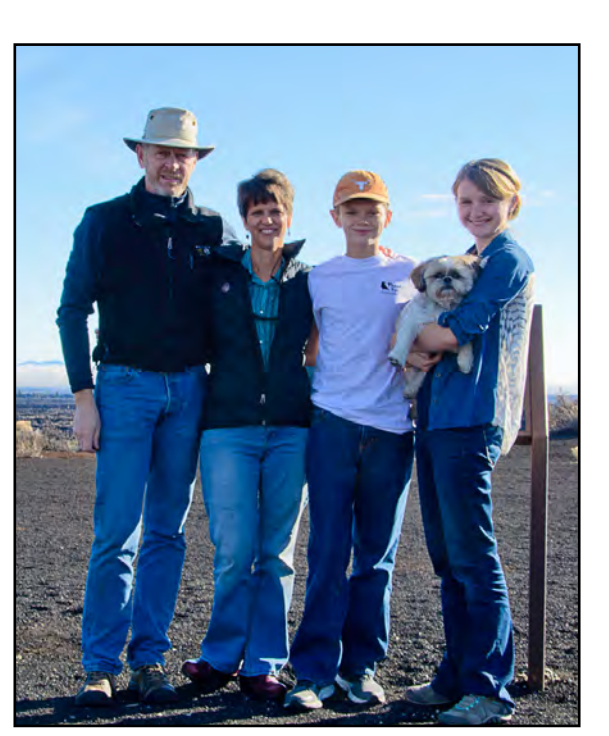
Our Family at Craters of the Moon National Monument and Preserve

education and workforce development. Regularly he updates the Governor and other state leaders on economic development activity and growth in areas ranging from mining to unmanned autonomous systems (drones). His research and data analysis is