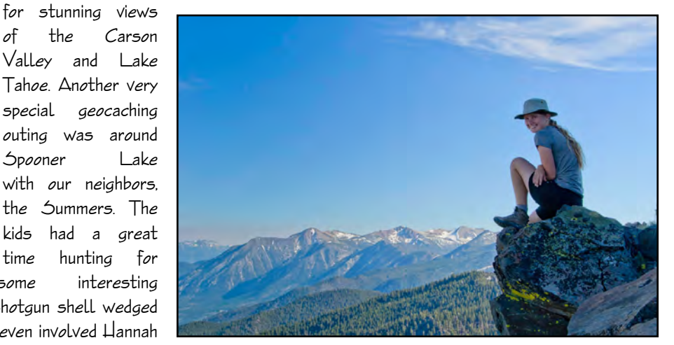
Lannah on Genoa Peak

geocaches, including one hidden in a old shotgun shell wedged into the base of a tree. Finding one cache even involved Hannah getting a boost from her Dad's shoulders into a tall tree. Geocaching is always an adventure!