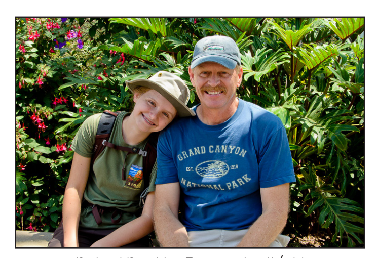
Dad and Daughter Enjoying Sea World