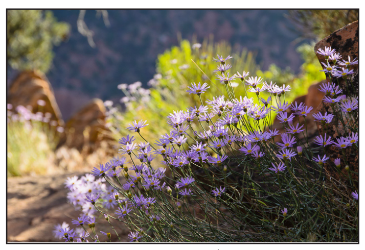
Spring Flowers in Zion National Park