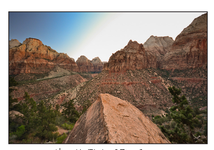
Llannah's Photo of Zion Canyon