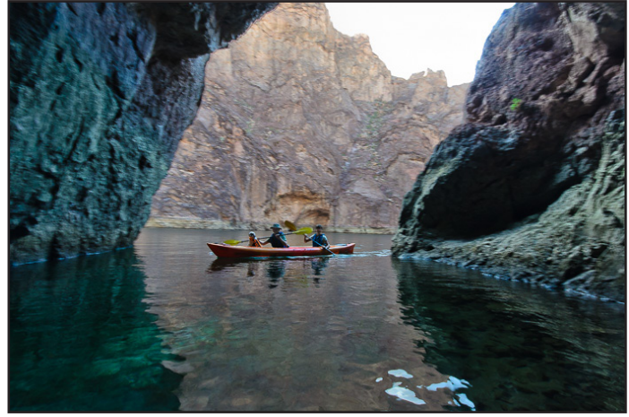
Kayaking on the Colorado River

Make sure you check out our family website at: <u>www.pottsadventures.com</u>