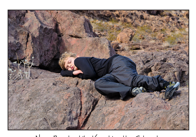
Noon Break while Kayaking the Colorado