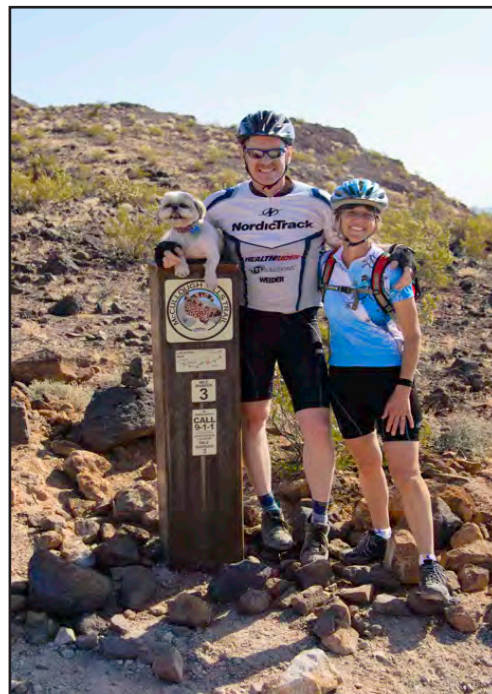
Even the dog comes along