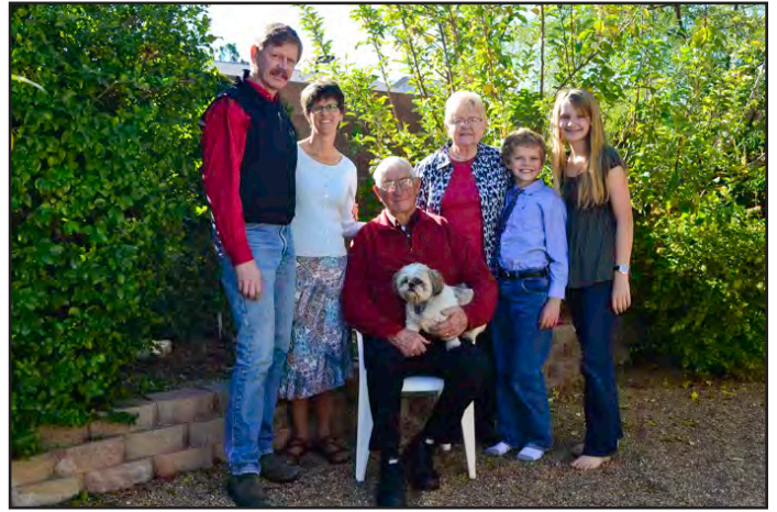
Thanksgiving Day with Grandpa and Grandma Potts