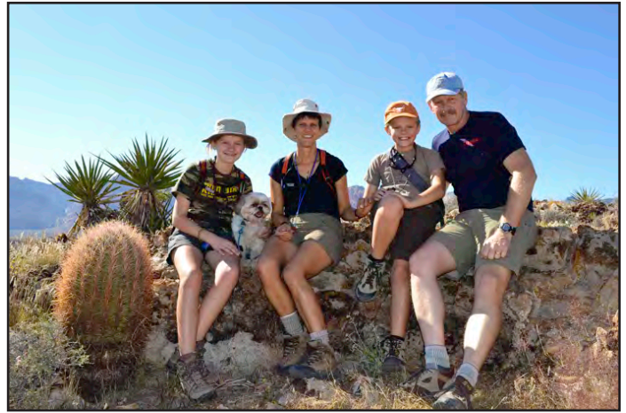
Geocaching is a great family activity

(known as SWAG ). When you find the cache, you log it on your GPS and then sign the registry. There are caches hidden all over the world (by last count there are over 2.2 million). Trackables are a special type of SWAG that are picked up by geocachers to be placed in other geocaches and then logged on the internet to track their travels. One of our family's trackables has traveled to England and is currently in Venice! Caleb even got a GPS for his 10th birthday and is an expert at using it. It is a great family activity that can be done anywhere.