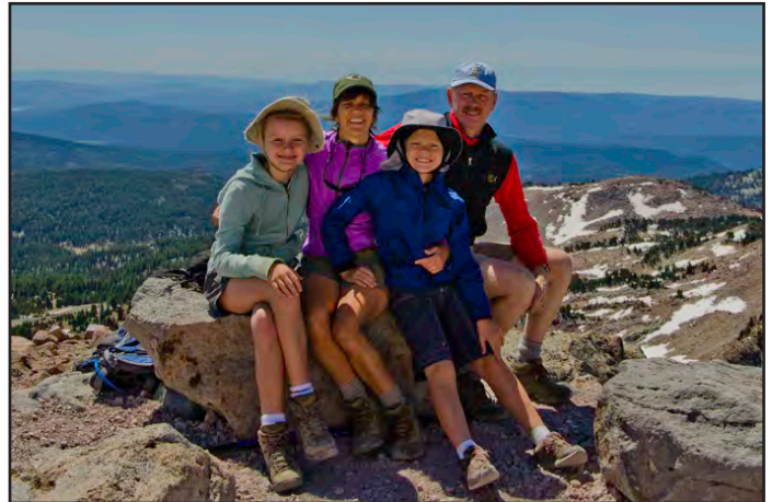
Our Family in Lassen National Park