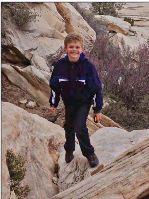
Geocaching in Red Rock Canyon