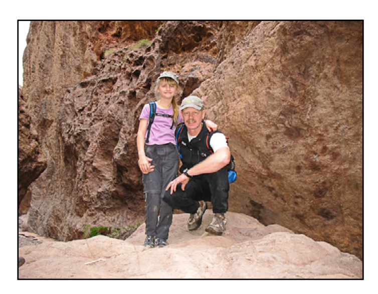
Goldstrike Canyon - February 5th

Some of our adventures this year include: