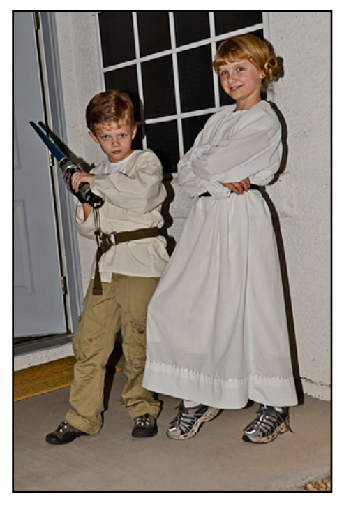
The Kids as Princess Leia and Luke Skywalker for Halloween