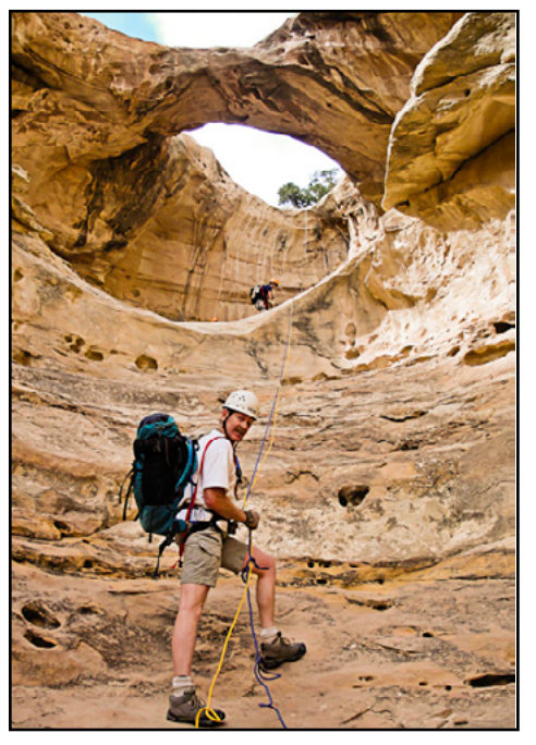
Rappelling through Jughandle Arch, UT