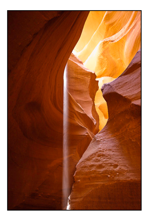
Antelope Canyon, AZ