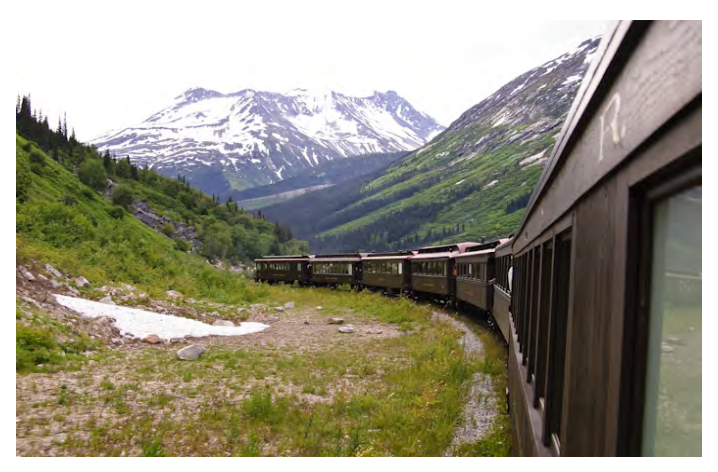
Our Rail Ride from Skagway to White Pass

us to beautiful Auke Bay where we boarded a triple-deck whale watching boat. It was great to feel the brisk wind in your face and see the huge glacier covered mountains all around. The scenery alone was well worth the trip. We arrived at the whale watching area and thoroughly enjoyed watching humpback whales surface all around our boat. In all we saw 30 - 40 humpback whales blowing and slapping their tails. Our tour guide then took us to another area to look for Orcas, or "killer whales". There we saw a pod of Orcas with a mom, dad and baby surface right next to the boat! That was a special moment. We also watched bald eagles and sea lions playing in the water. We even saw our dream retirement home — a beautiful lighthouse nestled