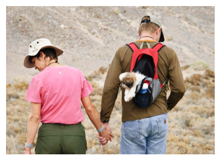
Still in love after all these years (toting the new "baby")

For all our "new" things, we are exceptionally grateful for the things that have stayed the same - our wonderful