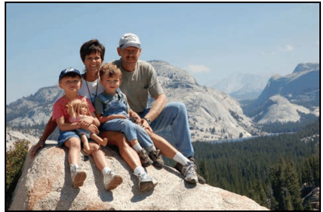
Our Family in Yosemite National Park

One of the first highlights this past year was a road trip to Moab, Utah to mountain bike the 100-mile White Rim Trail around Canyonlands National Park. This trail is mostly unimproved dirt roads and slick rock that winds around a sandstone rim high above the Colorado and Green rivers in the Park. We met Bob's parents in an RV park in Moab to visit, sightsee, and have them watch our kids for the three